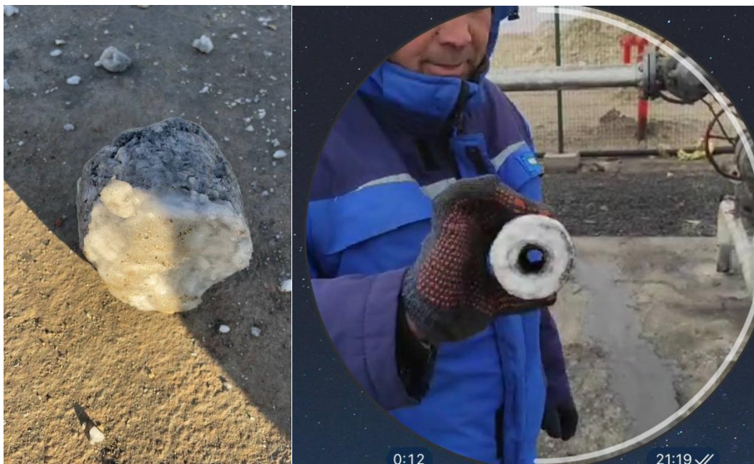
Fig 1. Hydrates extracted from flowlines.

During the autumn-winter period, well flowlines are susceptible to icing (hydrate formation) under specific combinations of pressure and temperature. During this process, the internal sections of the pipes are filled with "ice," resulting in narrowing and sometimes complete obstruction of gas movement through the intra-field collector. This leads to emergency consequences such as ruptures of field collectors, well loading, and other failures.