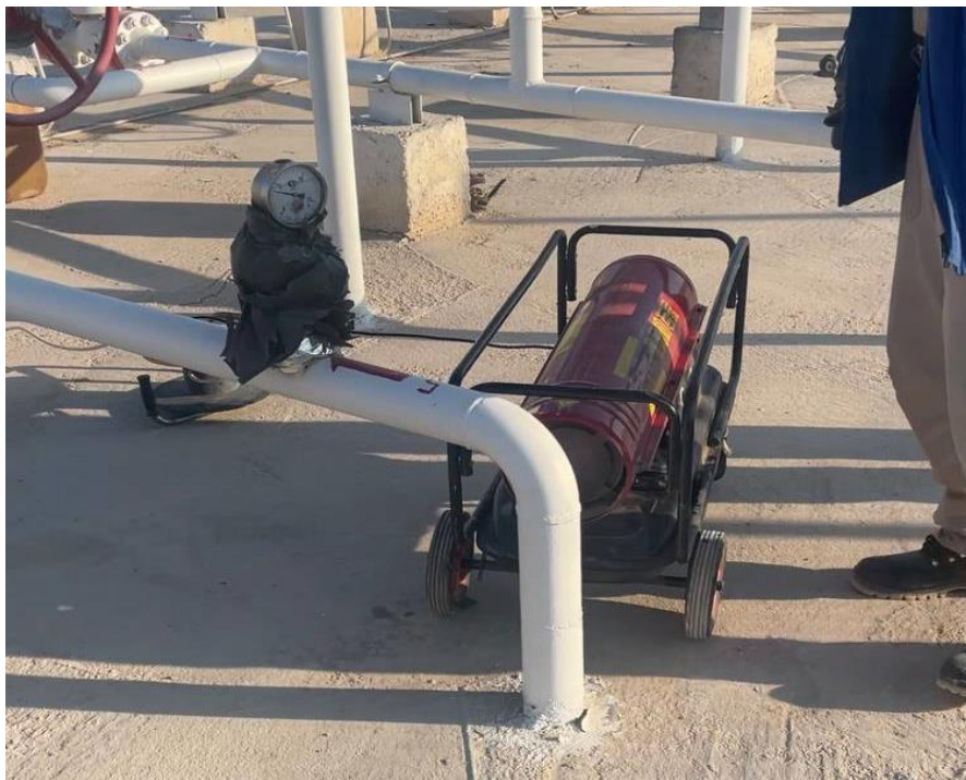
Fig 4. Heating a blockage site with a heat gun.

5. Two-sided bleeding followed by thawing: This is the safest method. Its disadvantages include significant time consumption—the plug may not disintegrate for an indefinite period—and substantial production losses.