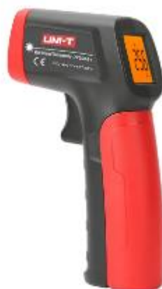
Fig 3. Infrared thermometer.

3. Line blowdown: If the pressure on the gauge drops instantaneously upon venting, it indicates the plug is nearby. The distance to the plug is determined by the rate of pressure drop.