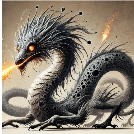
Figure 3. The image of the dragon that Farhad encountered