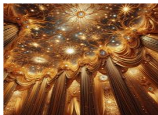
Figure 2. Image of the palace ceiling

It was covered with the golden thread of the sun.[1.74]