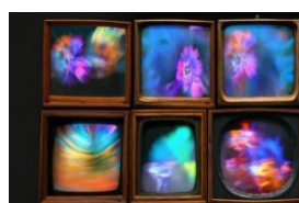
Figure 4. The image of the mirror of the world

The third symbol in the epic is the iron man "Then a statue made of iron will be clearly visible inside the gate. The statue will resemble a man, and in his hand will be an iron rainbow. It will seem as if he is putting an arrow into his rainbow that can pierce any hard stone. However, the statue will be wrapped in iron armor burning like fire from head to toe. And in his chest hangs a mirror, its light as bright as the mirror of the Sun.