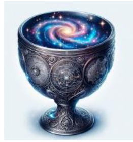
Figure 1. Jamshid's Jom

In Chapter XVII, which contains the "Description of the Seasons", Navoi writes: "In the palace, golden silk fabrics spread in all directions were studded with gems like stars. All these fabrics seemed radiant to the eye, as if woven from the golden thread of the sun." It is not surprising that the now-familiar ceiling images (nadezhny patalok) came to our mind.