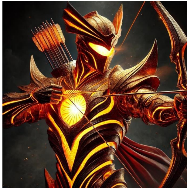
Figure 5. The image of the Iron Man

At the door, he is an iron god or a mind [1.118]